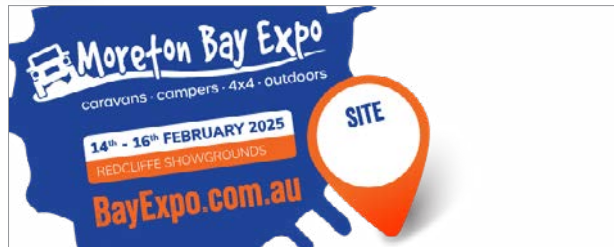
Email Signature Template 1