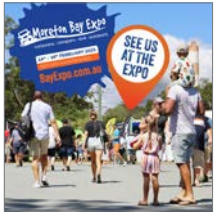
Social Media Post 1