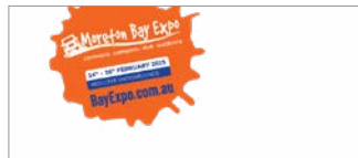
Facebook Cover Template 2