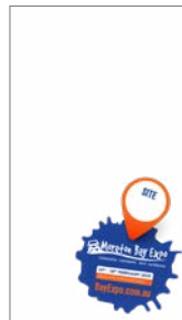
Social Media Story Template