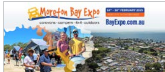
Facebook Cover 1