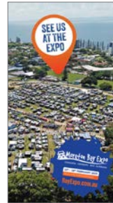
Social Media Story