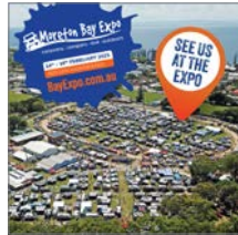
Social Media Post 2