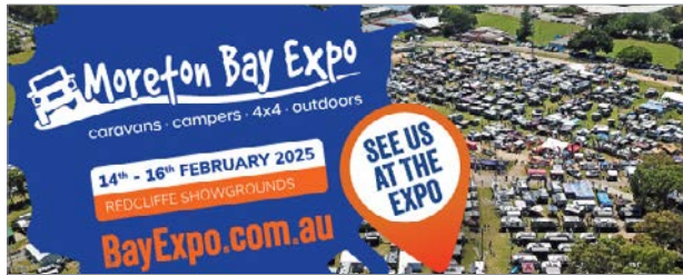
Email Signature 1