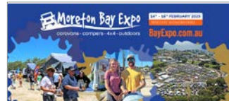
Facebook Cover 2